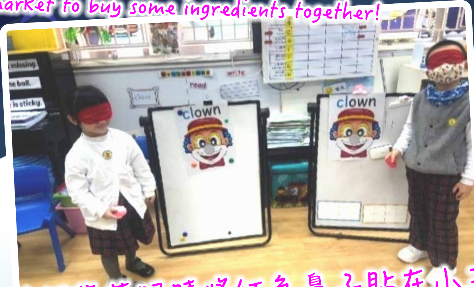
我們蒙著眼睛將紅色鼻子貼在小丑上。 Look at us pin the nose on the clown!