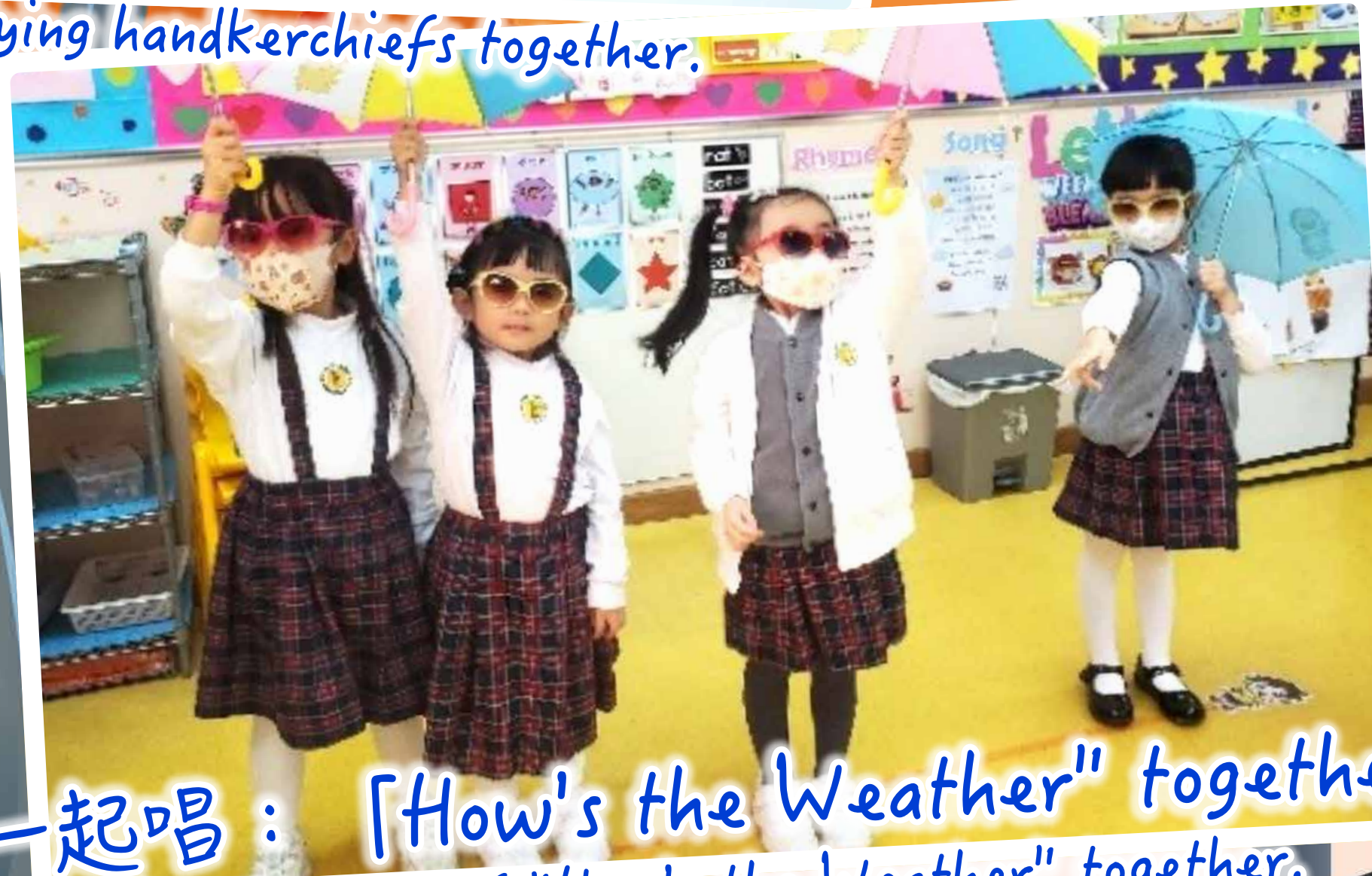
我們一起唱：「How's the Weather" together.」

Singing the song of "How's the Weather" together.