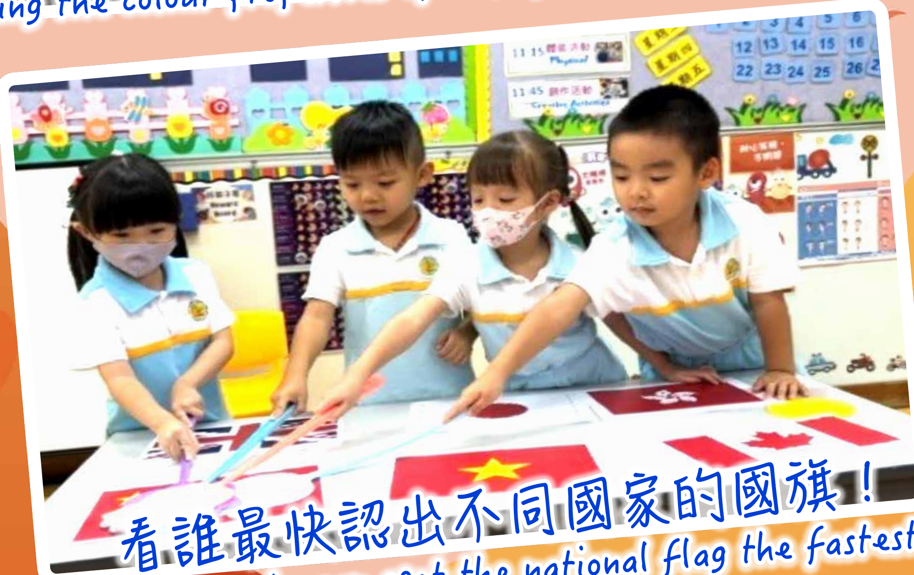
看誰最快認出不同國家的國旗！ Let's see who can spot the national flag the fastest!