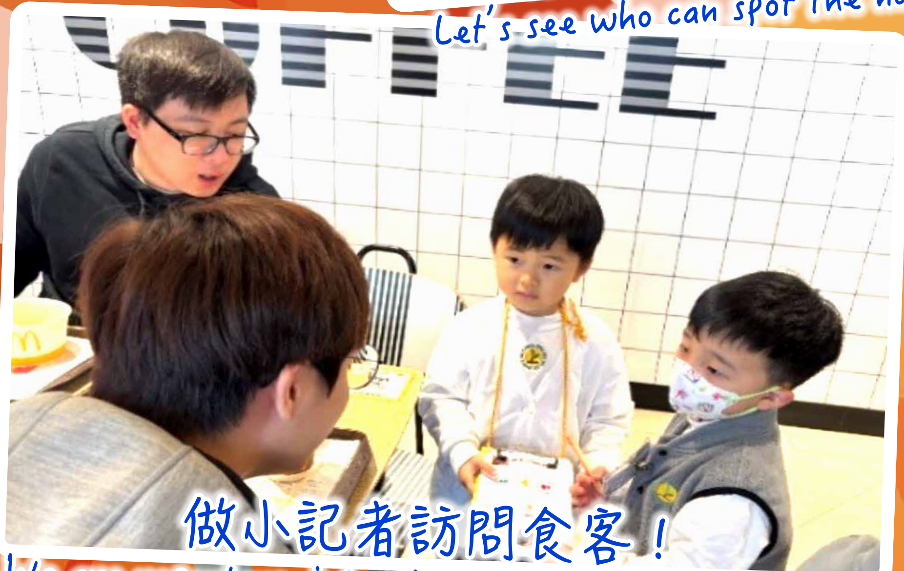
做小記者訪問食客！ We are reporters, interviewing different customers!