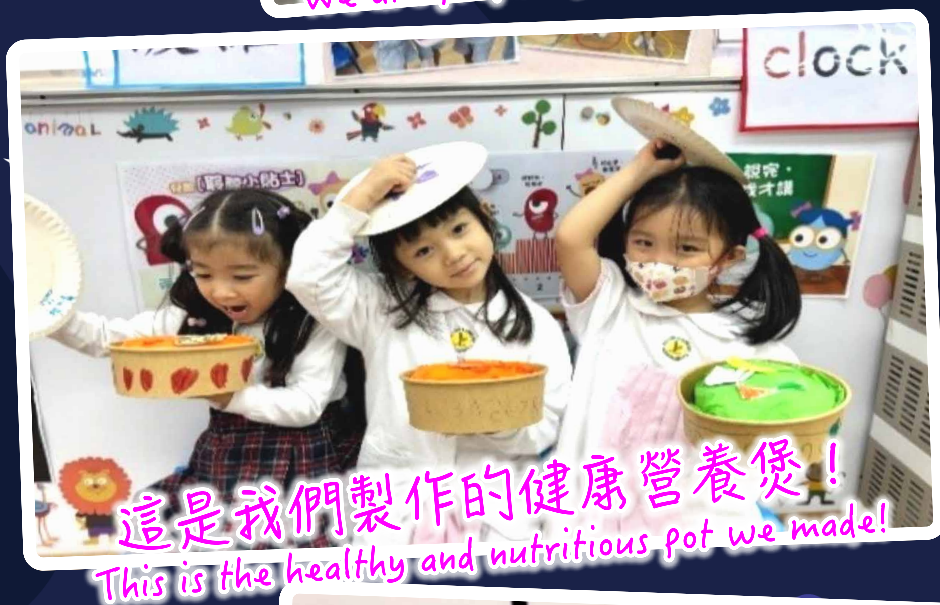
這是我們製作的健康營養煲！ This is the healthy and nutritious pot we made!