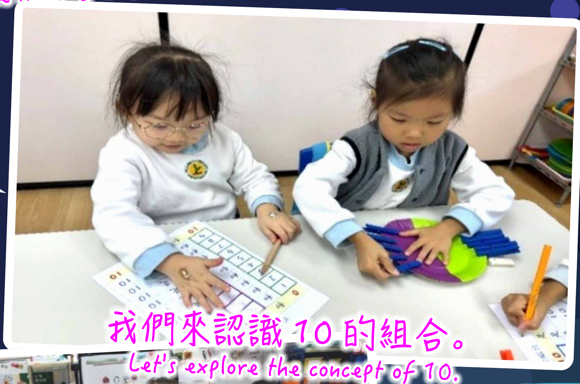
我們來認識 10 的組合。 Let's explore the concept of 10.