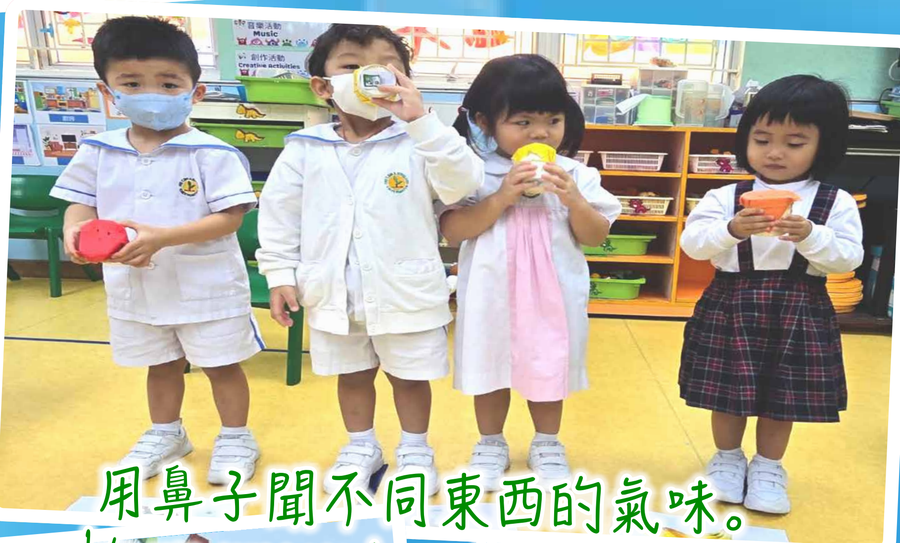
用鼻子聞不同東西的氣味。 We use our nose to smell different things!