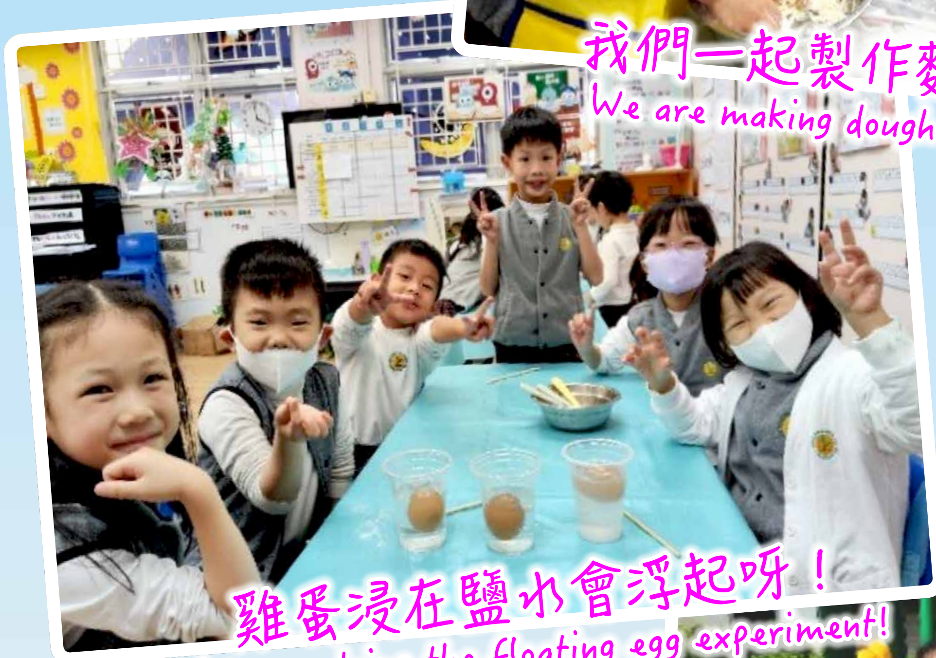
雞蛋浸在鹽水會浮起呀！ We are doing the floating egg experiment!