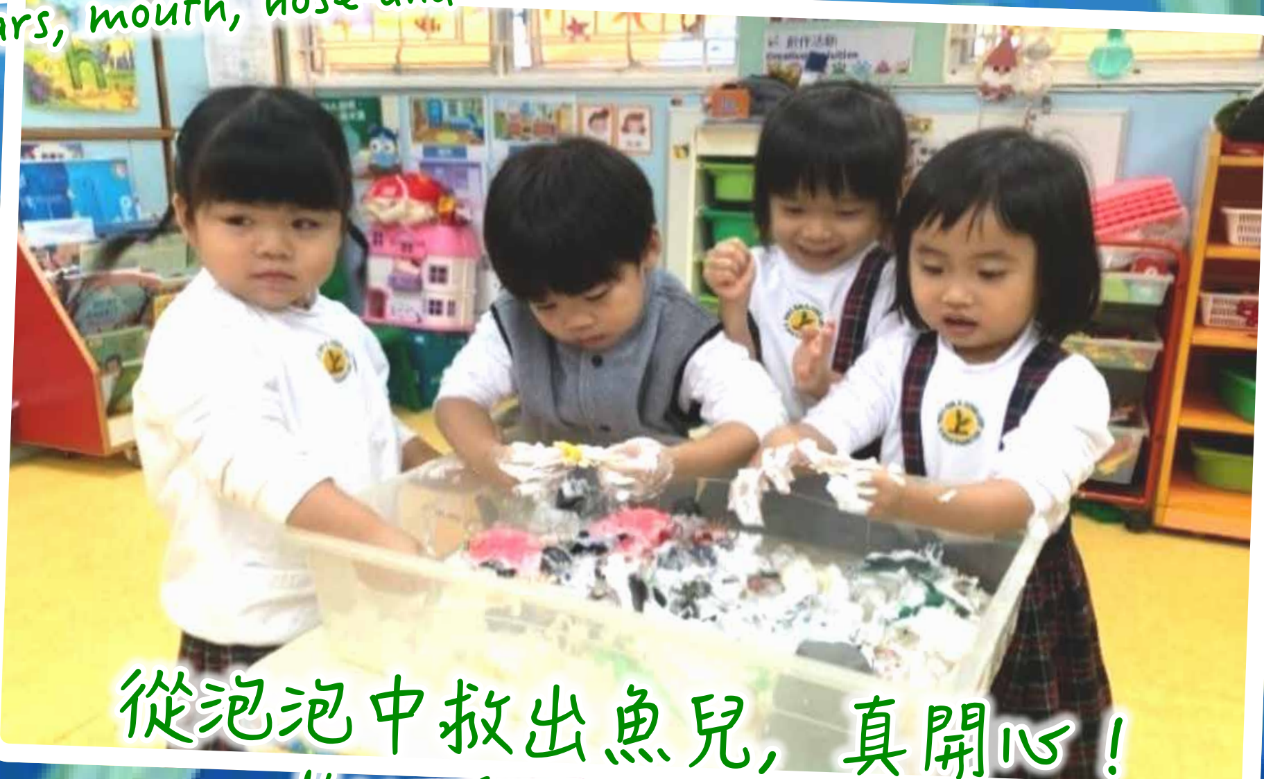
從泡泡中救出魚兒，真開心！ It was fun rescuing the fish!