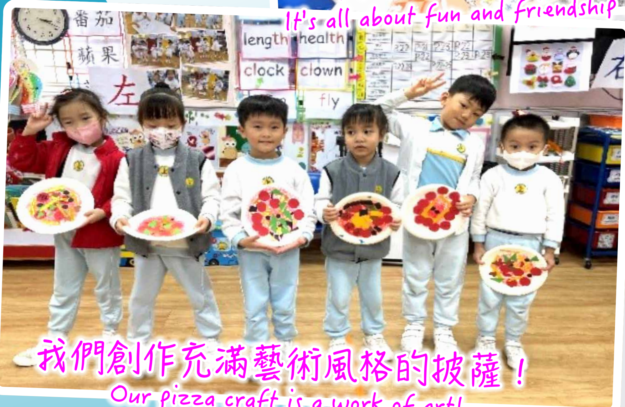
我們創作充滿藝術風格的披薩！ Our pizza craft is a work of art!