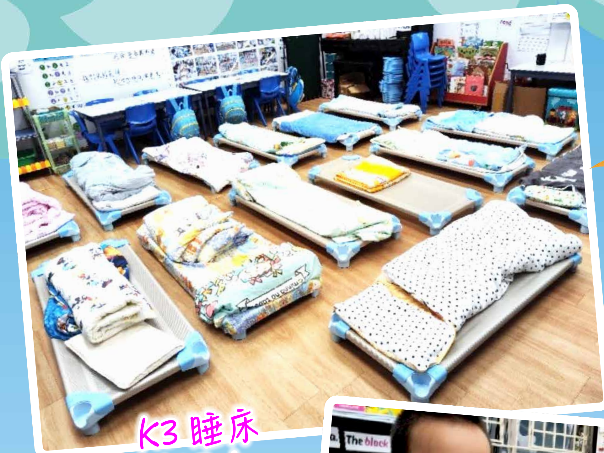
K3 睡床 K3 Beds