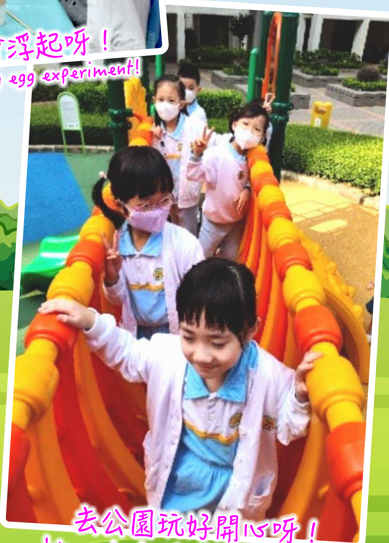
去公園玩好開心呀！ We are having fun in the playground!