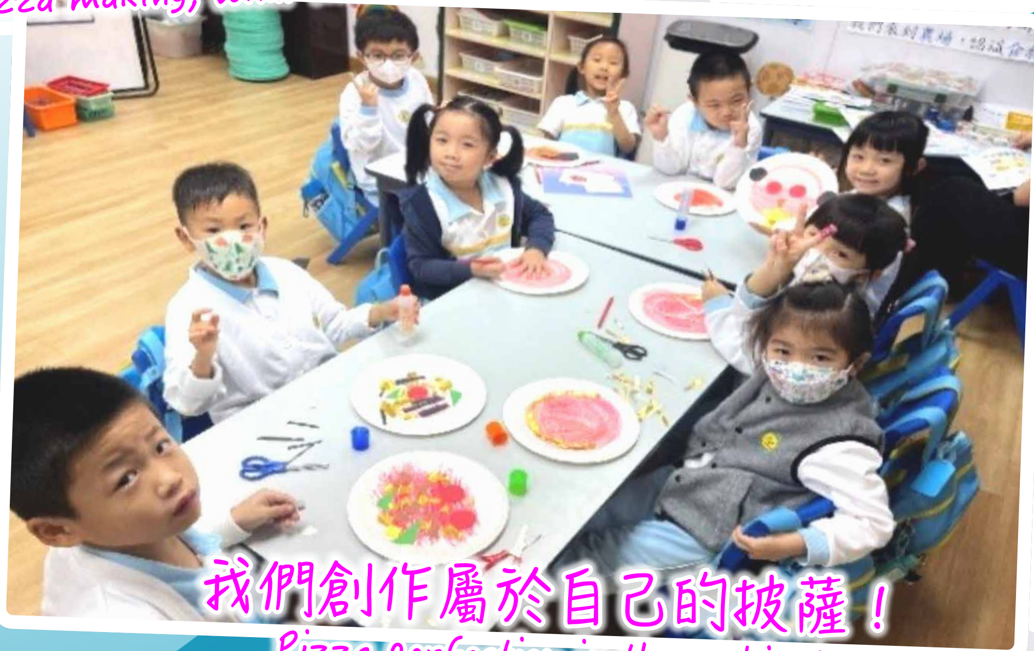
我們創作屬於自己的披薩！ Pizza perfection in the making!