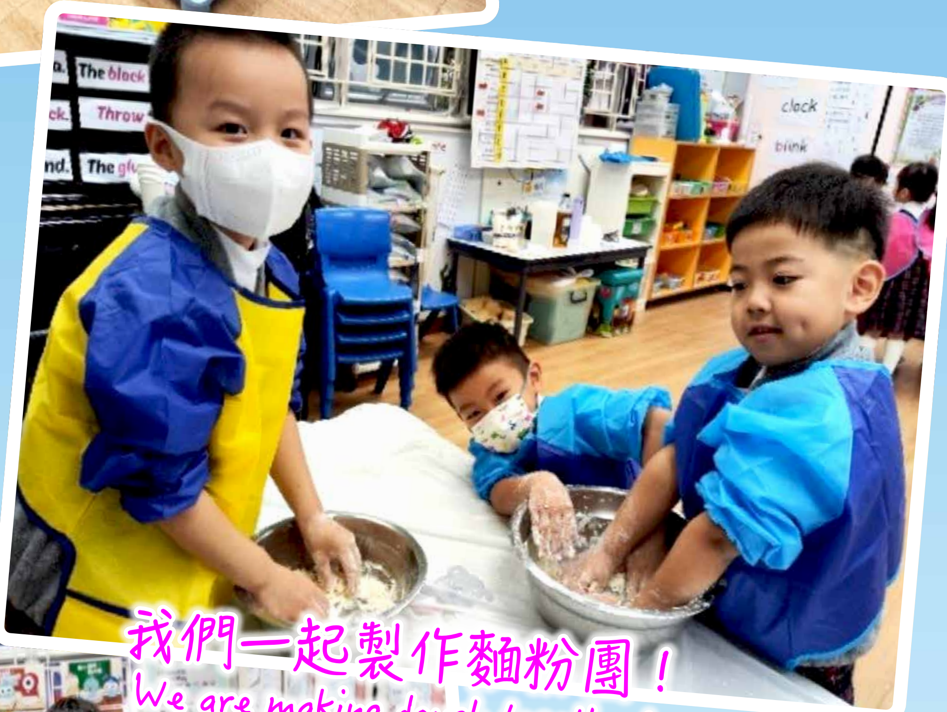
我們一起製作麵粉團！ We are making dough together!