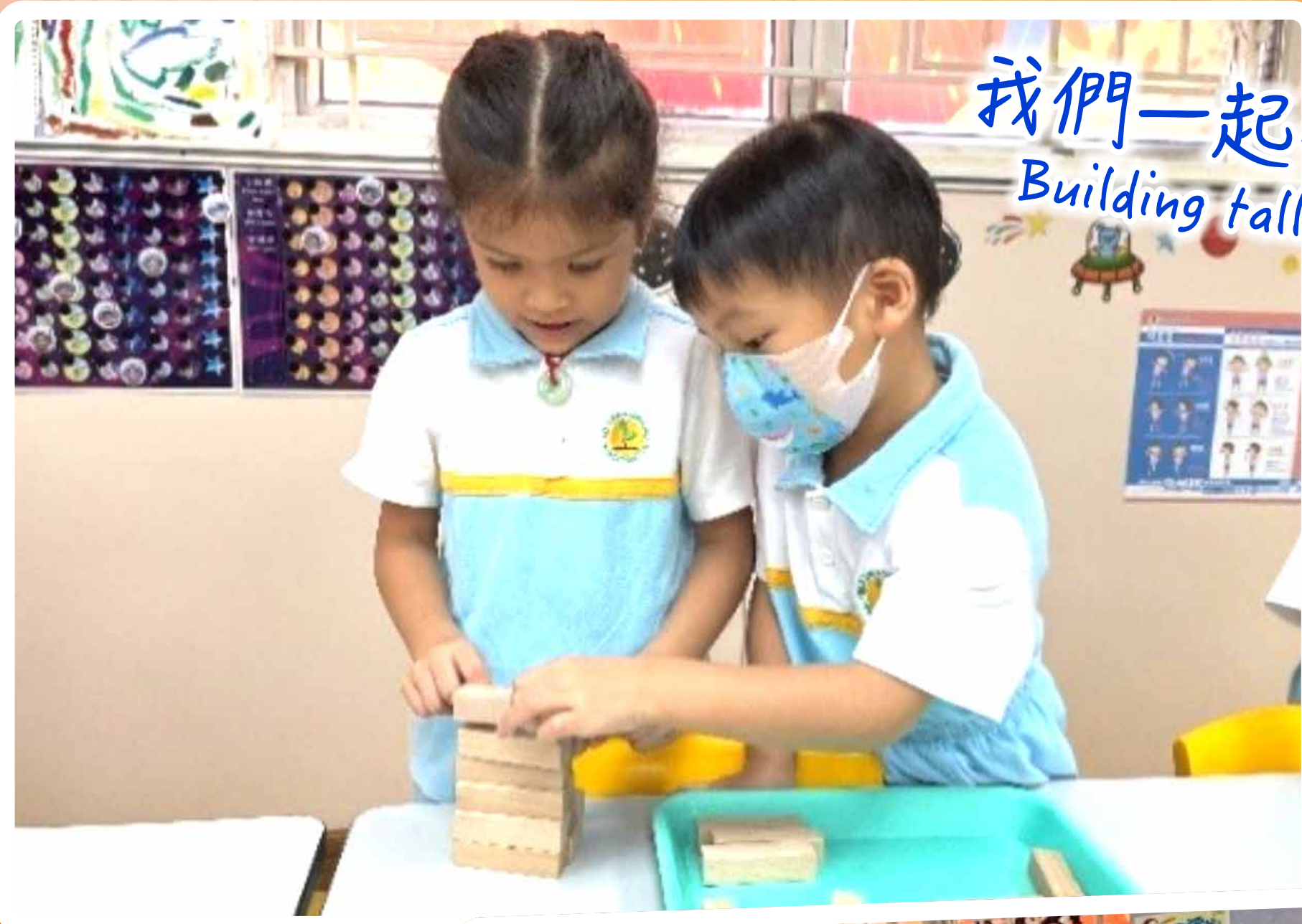
我們一起合作砌高塔。 Building tall towers together.