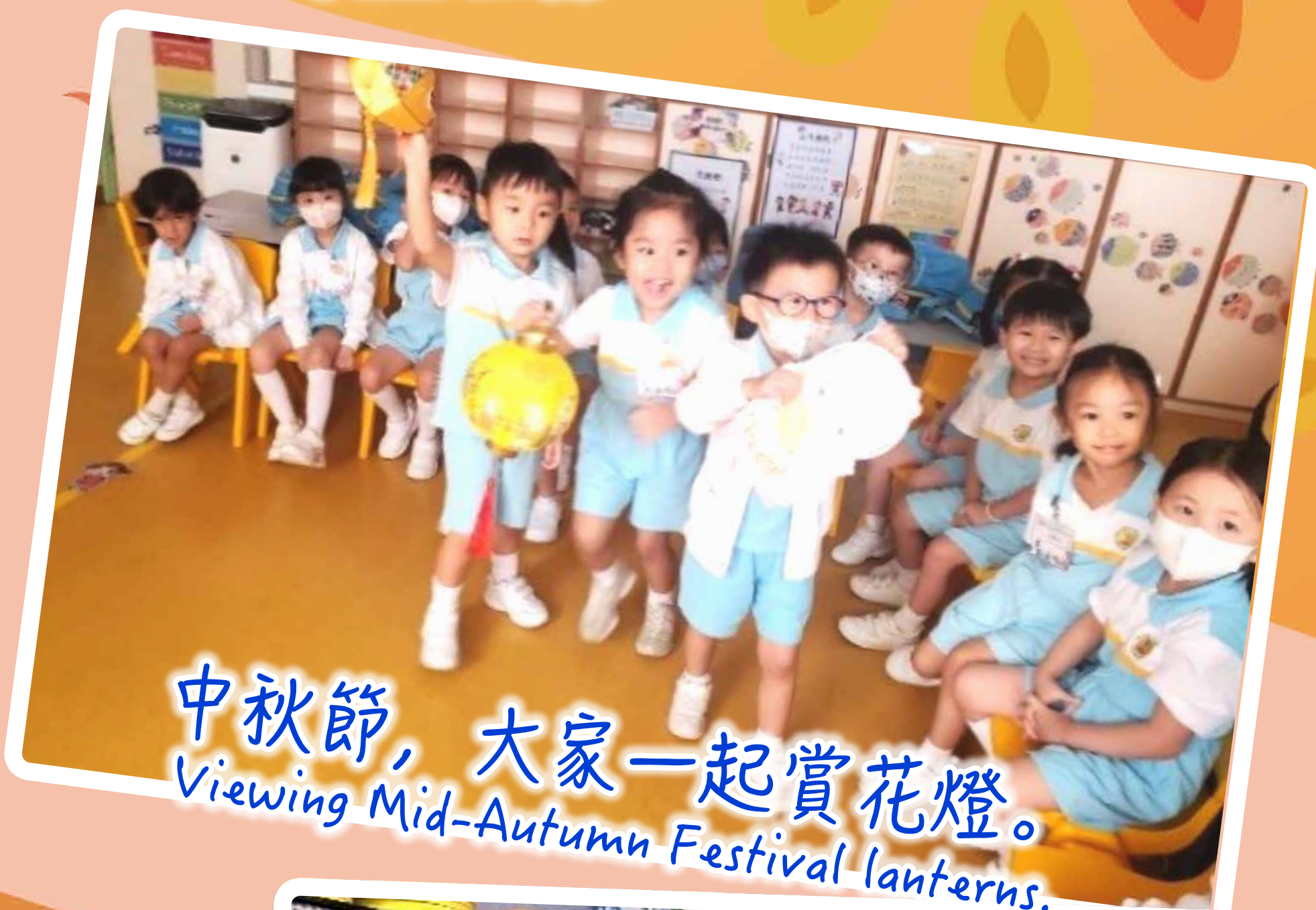
中秋節，大家一起賞花燈。 Viewing Mid-Autumn Festival lanterns.