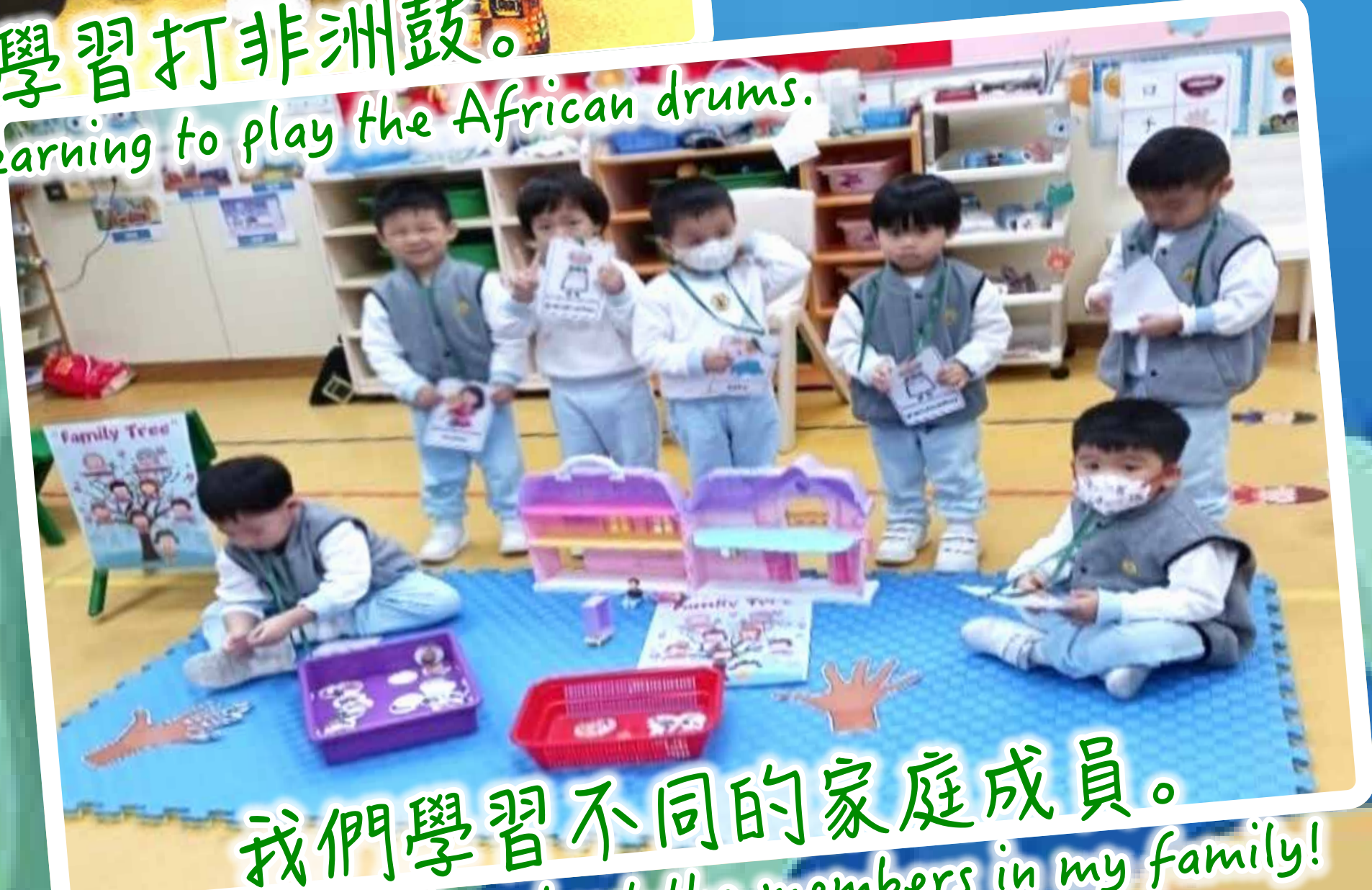
我們學習不同的家庭成員。 We're learning about the members in my family!