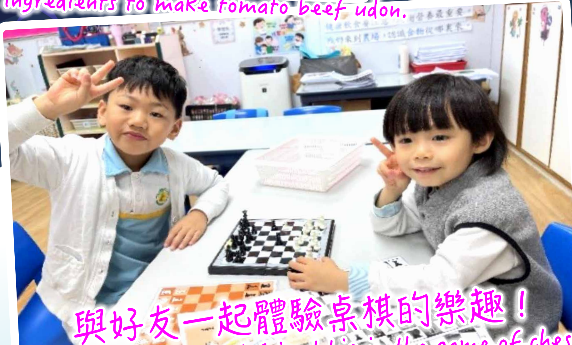
與好友一起體驗桌棋的樂趣！ It's all about fun and friendship in the game of chess!