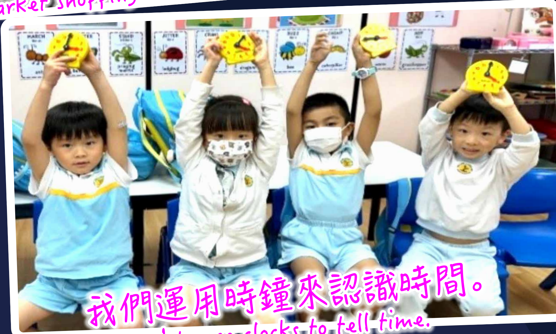
我們運用時鐘來認識時間。 We use clocks to tell time.