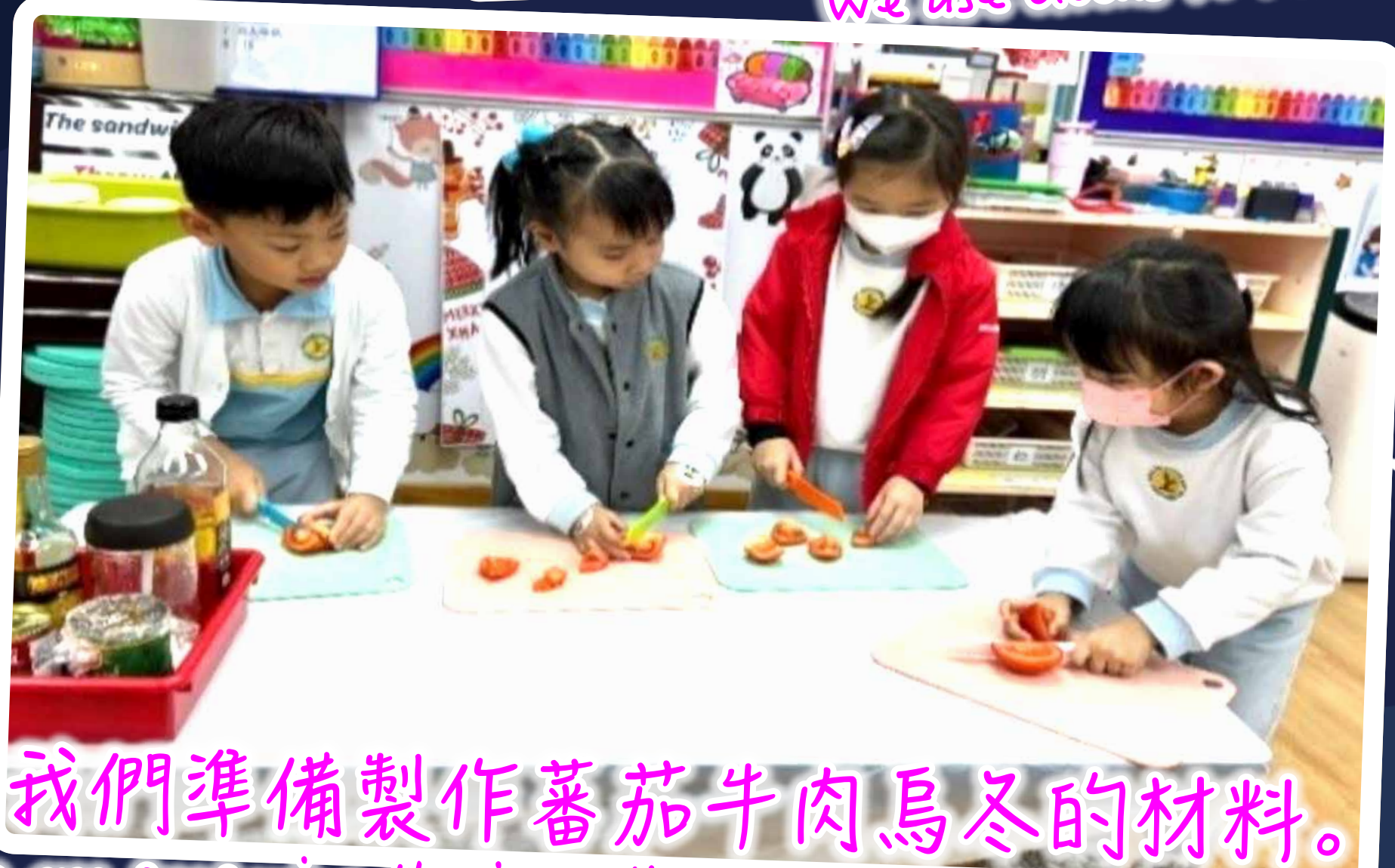
我們準備製作蕃茄牛肉烏冬的材料。 We are preparing the ingredients to make tomato beef udon.