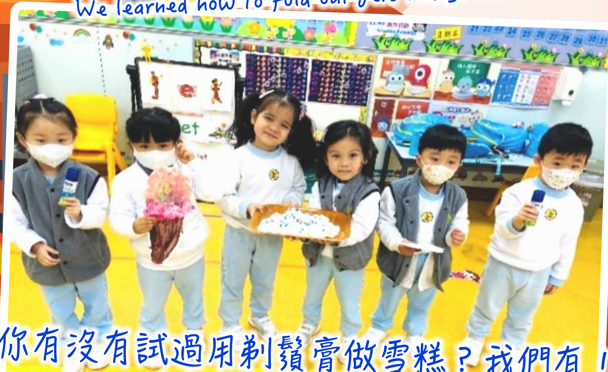
你有沒有試過用剃鬚膏做雪糕？我們有！ Have you ever made ice-cream with shaving foam. Well, we have!