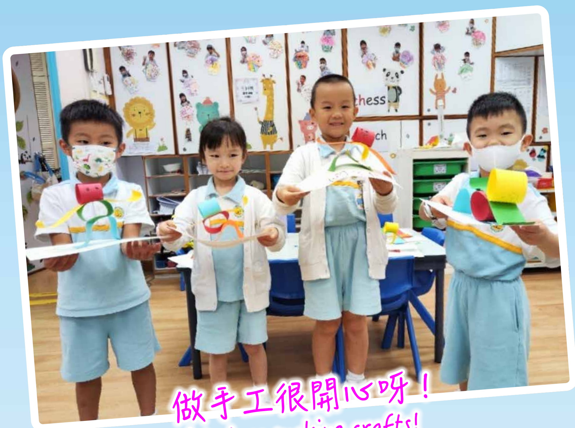
做手工很開心呀！ We love making crafts!