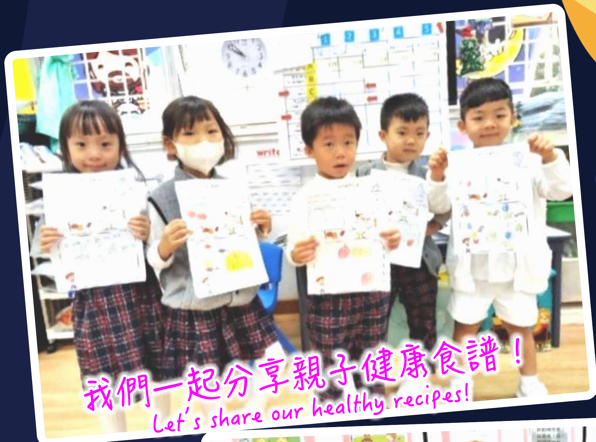
我們一起分享親子健康食譜！ Let's share our healthy recipes!