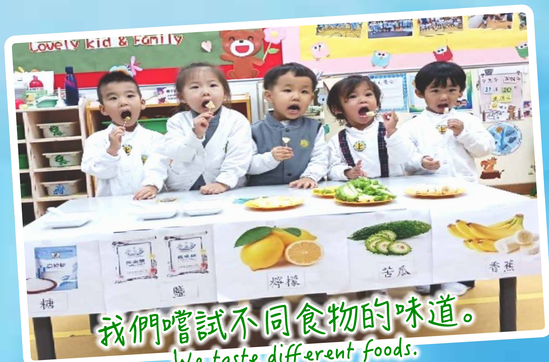
我們嚐試不同食物的味道。 We taste different foods.