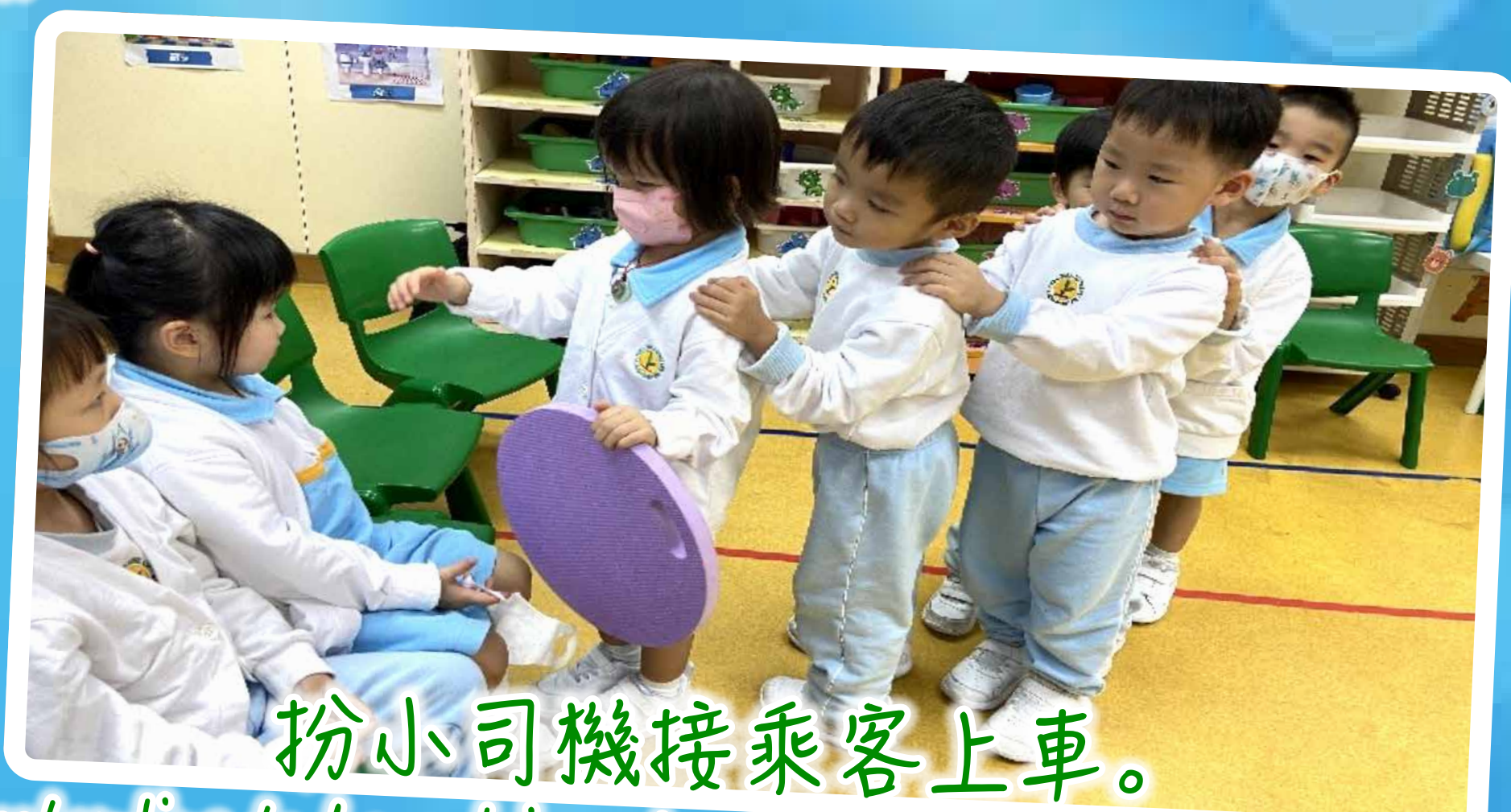
扮小司機接乘客上車。 Pretending to be a driver to pick up passengers on the bus.