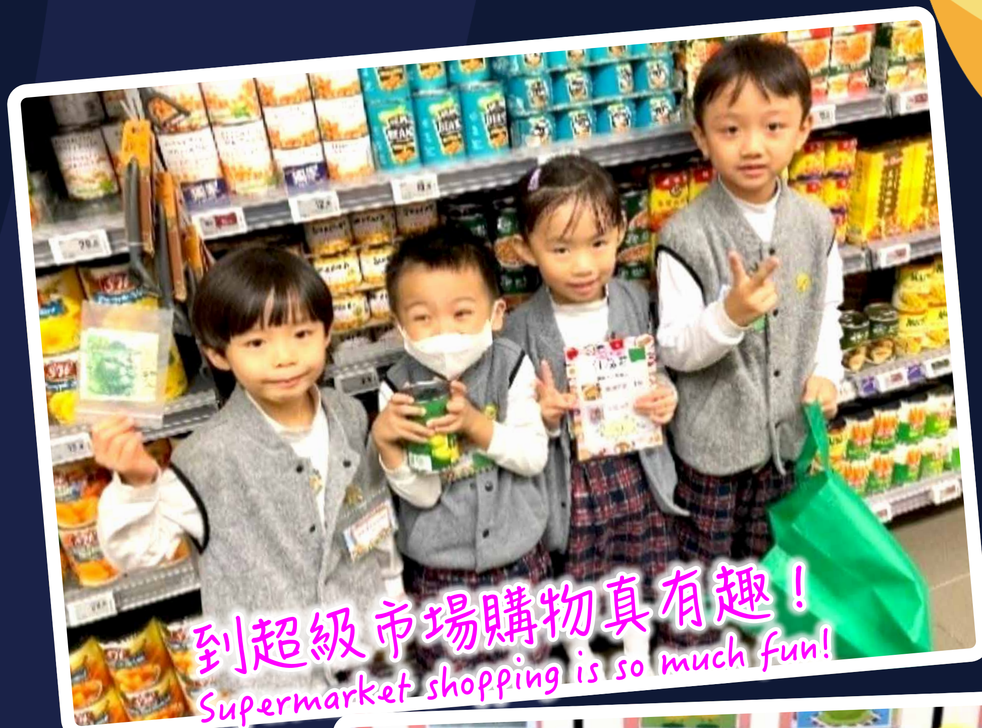
到超級市場購物真有趣！ Supermarket shopping is so much fun!