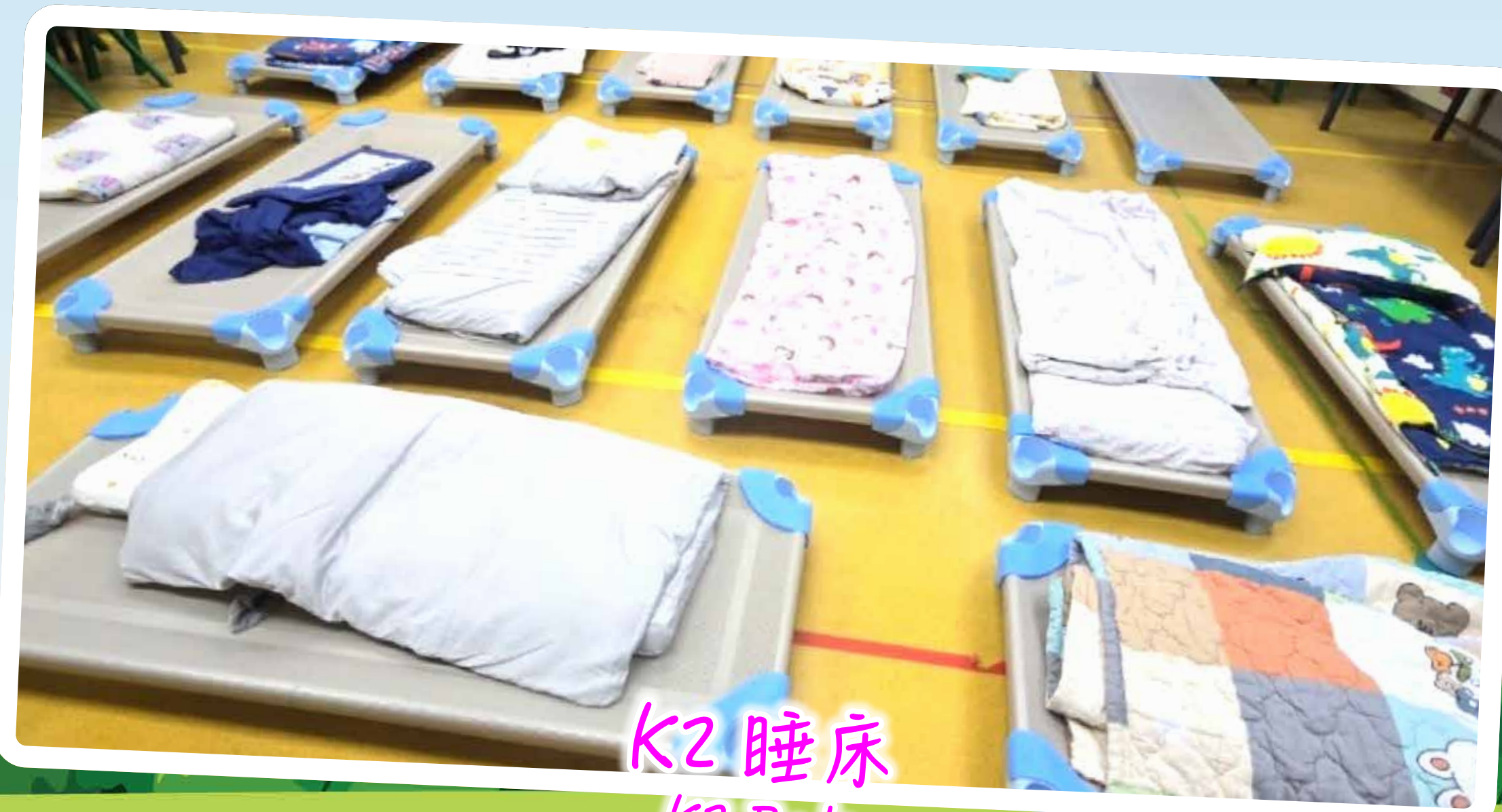
K2 睡床 K2 Beds