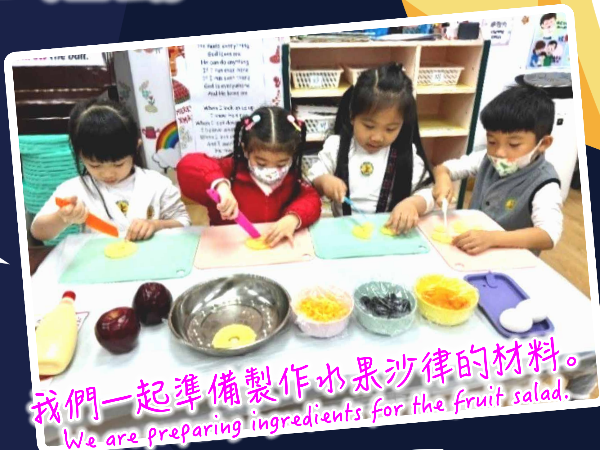
我們一起準備製作水果沙律的材料。 We are preparing ingredients for the fruit salad.