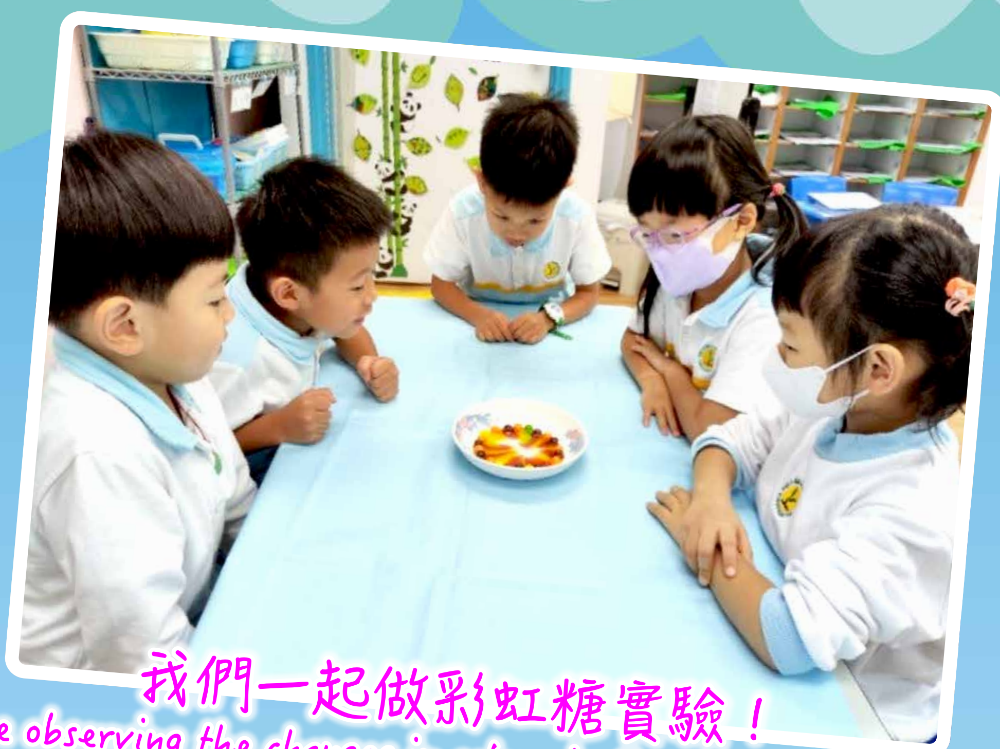
我們一起做彩虹糖實驗！ We are observing the changes in colour in the skittles experiment!