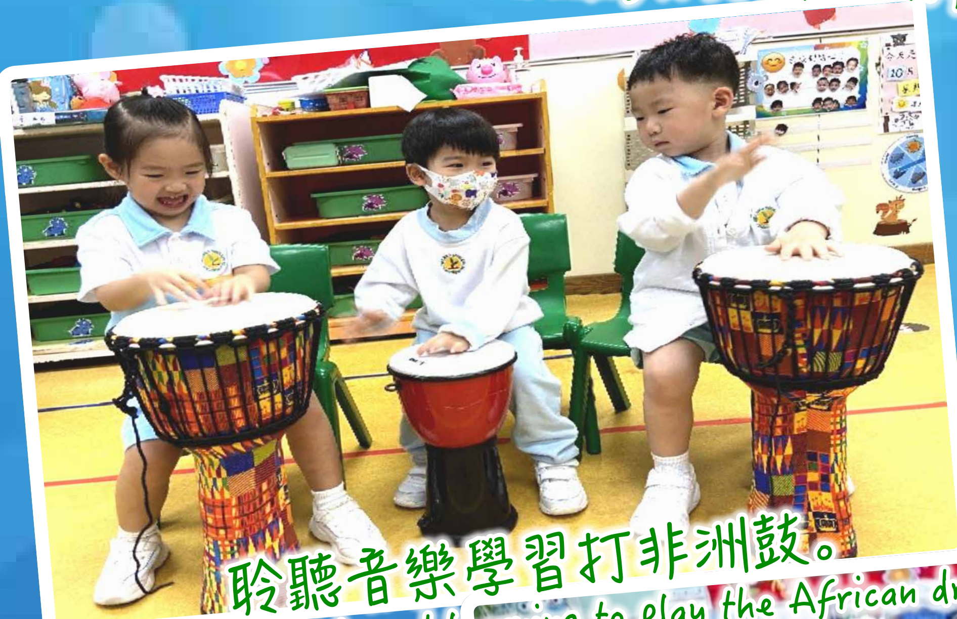
聆聽音樂學習打非洲鼓。 Listening to music and learning to play the African drums.