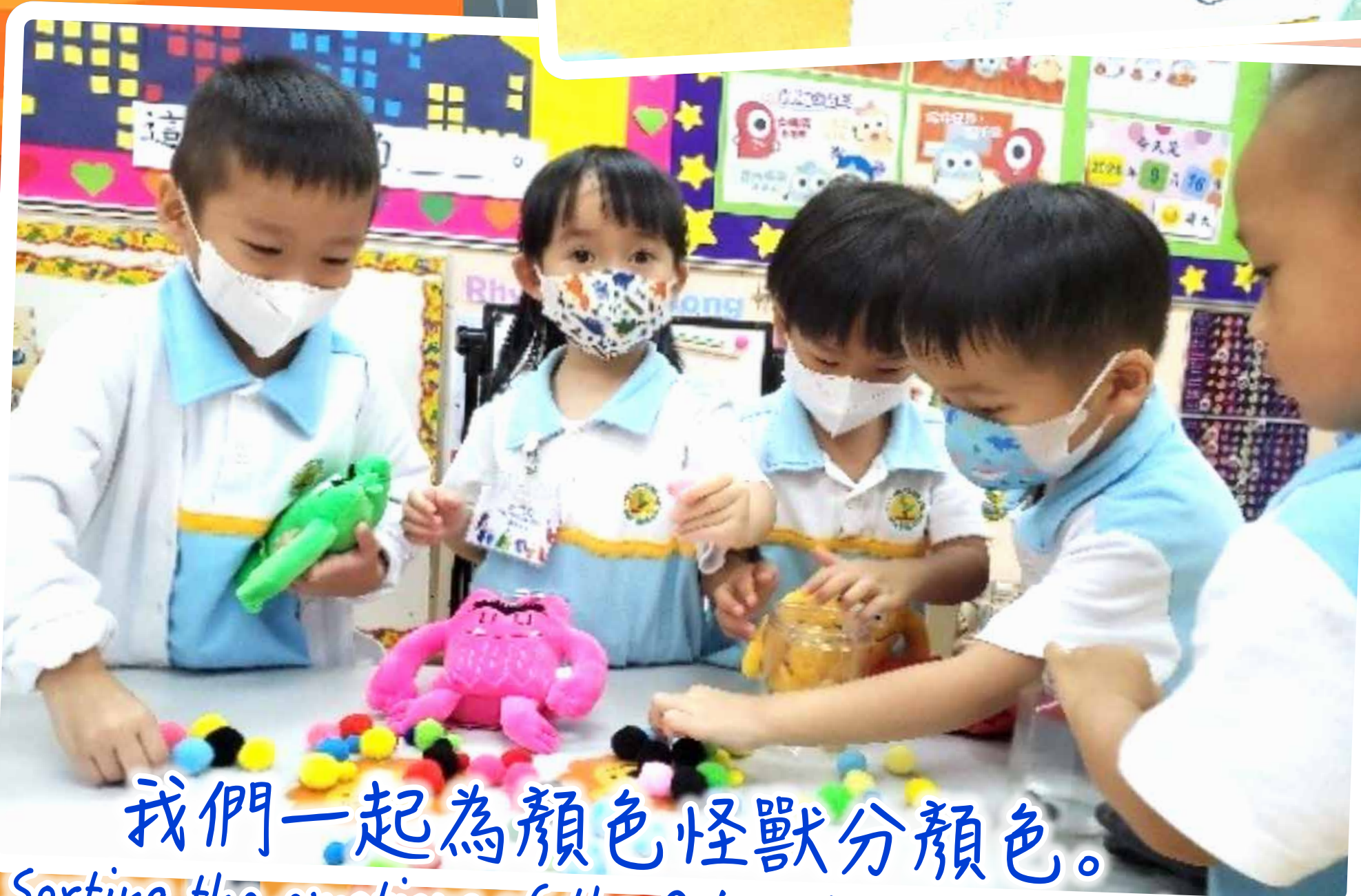
我們一起為顏色怪獸分顏色。 Sorting the emotions of the Colour Monsters into jars.