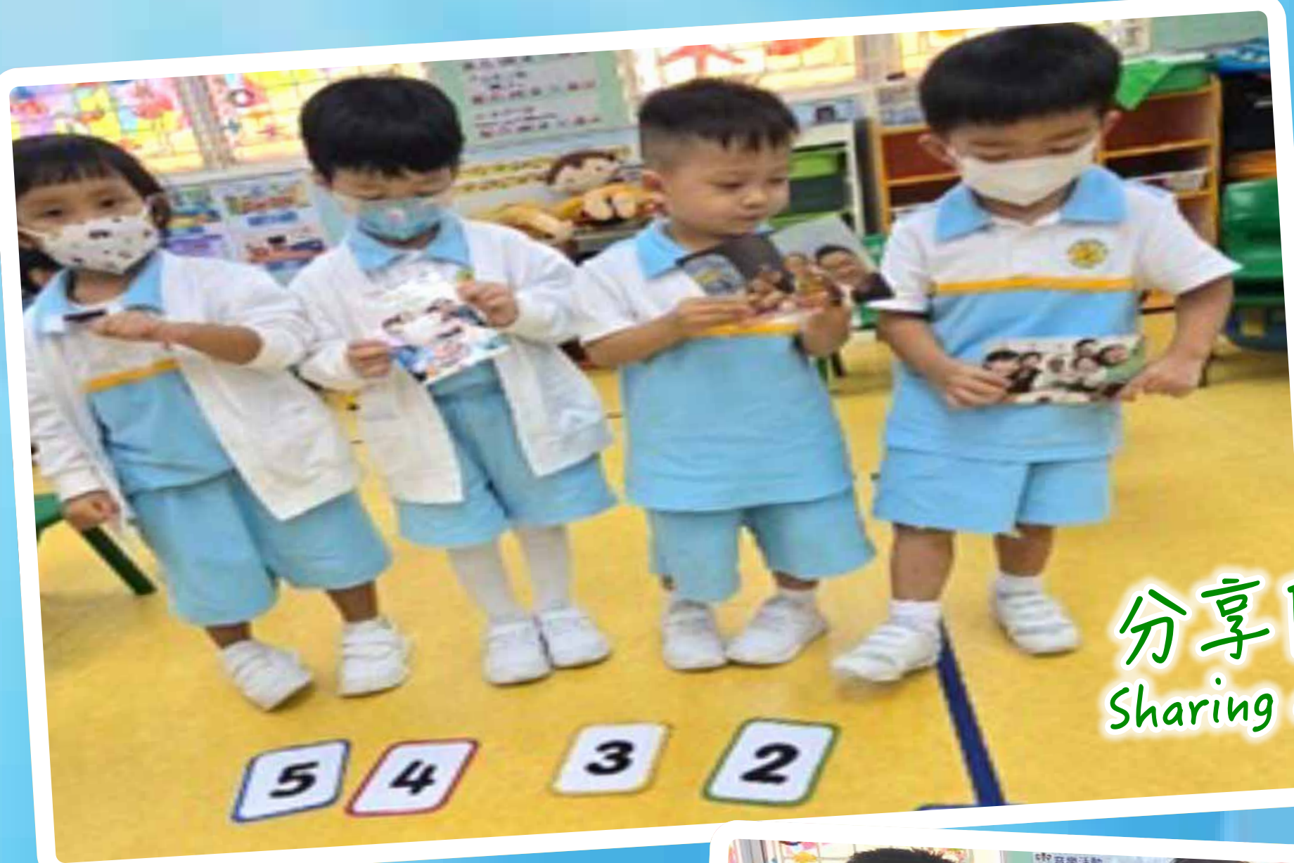
分享自己的家庭成員。 Sharing about our family members.