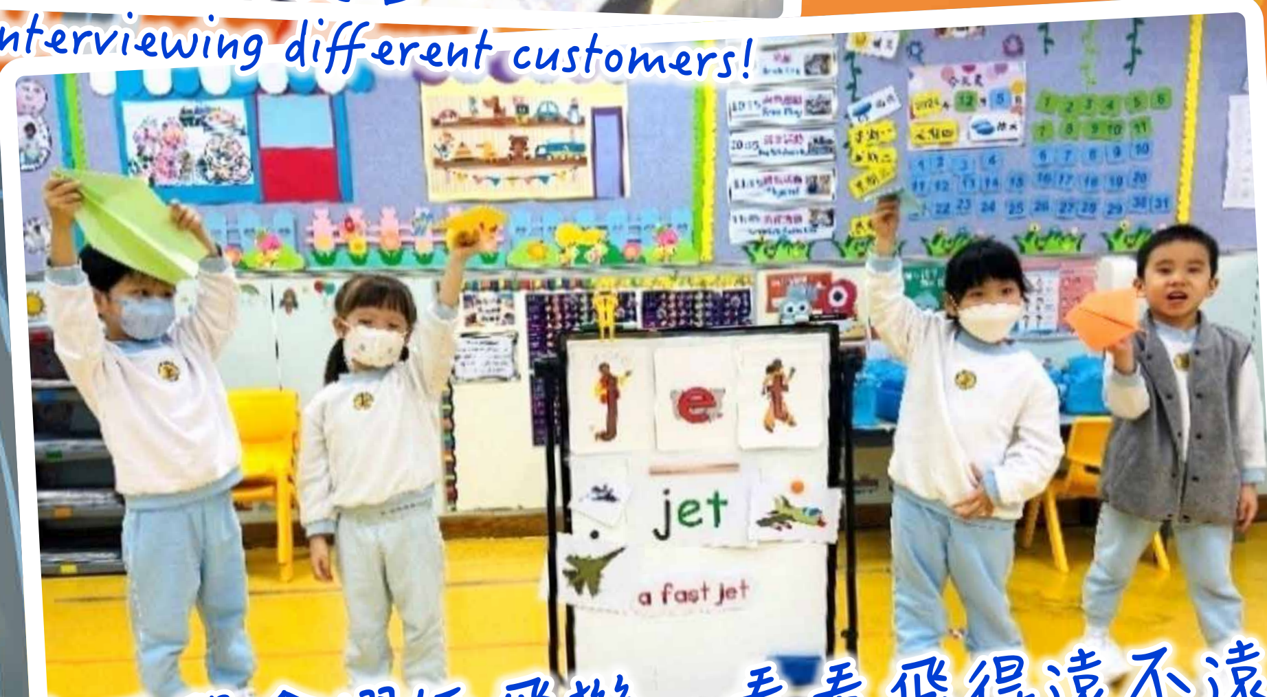
我們今天學會摺紙飛機，看看飛得遠不遠！ We learned how to fold out jets today. Let's see how far they go!