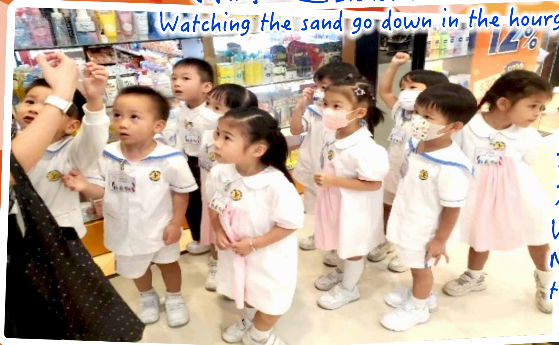
我們正在參觀杏花新城商場。 We went to Paradise Mall in Heng Fa Chuen together.

Watching the sand go down in the hourglass and learning to wait.