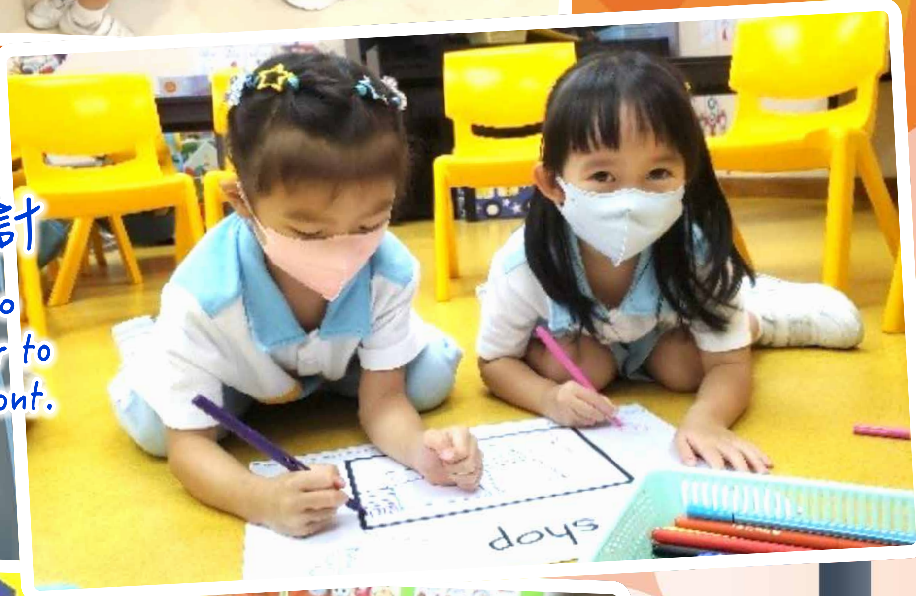
我們一起設計商店。 Working together to draw our shop front.