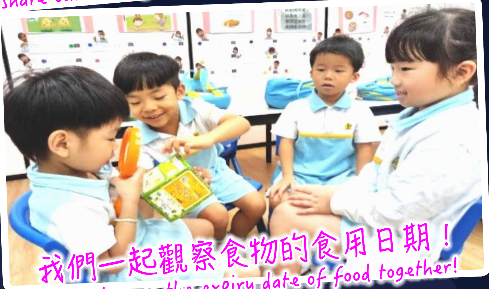
我們一起觀察食物的食用日期！ Let's observe the expiry date of food together!