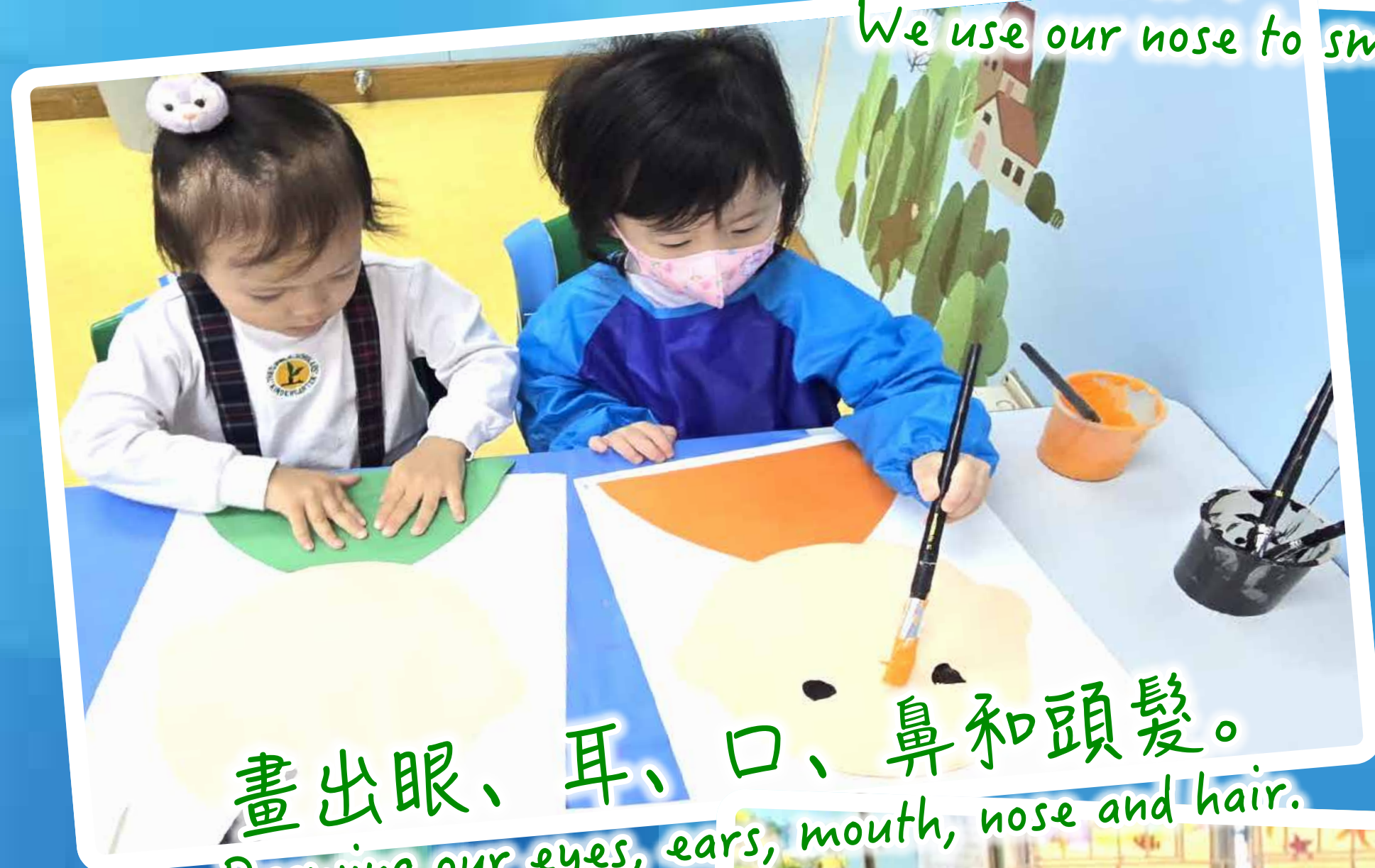
畫出眼、耳、口、鼻和頭髮。 Drawing our eyes, ears, mouth, nose and hair.