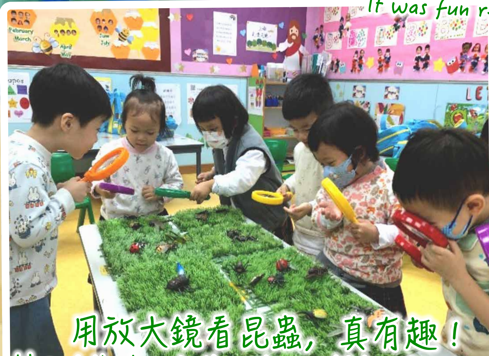
用放大鏡看昆蟲，真有趣！ Looking at the insects through magnifying glasses was cool!