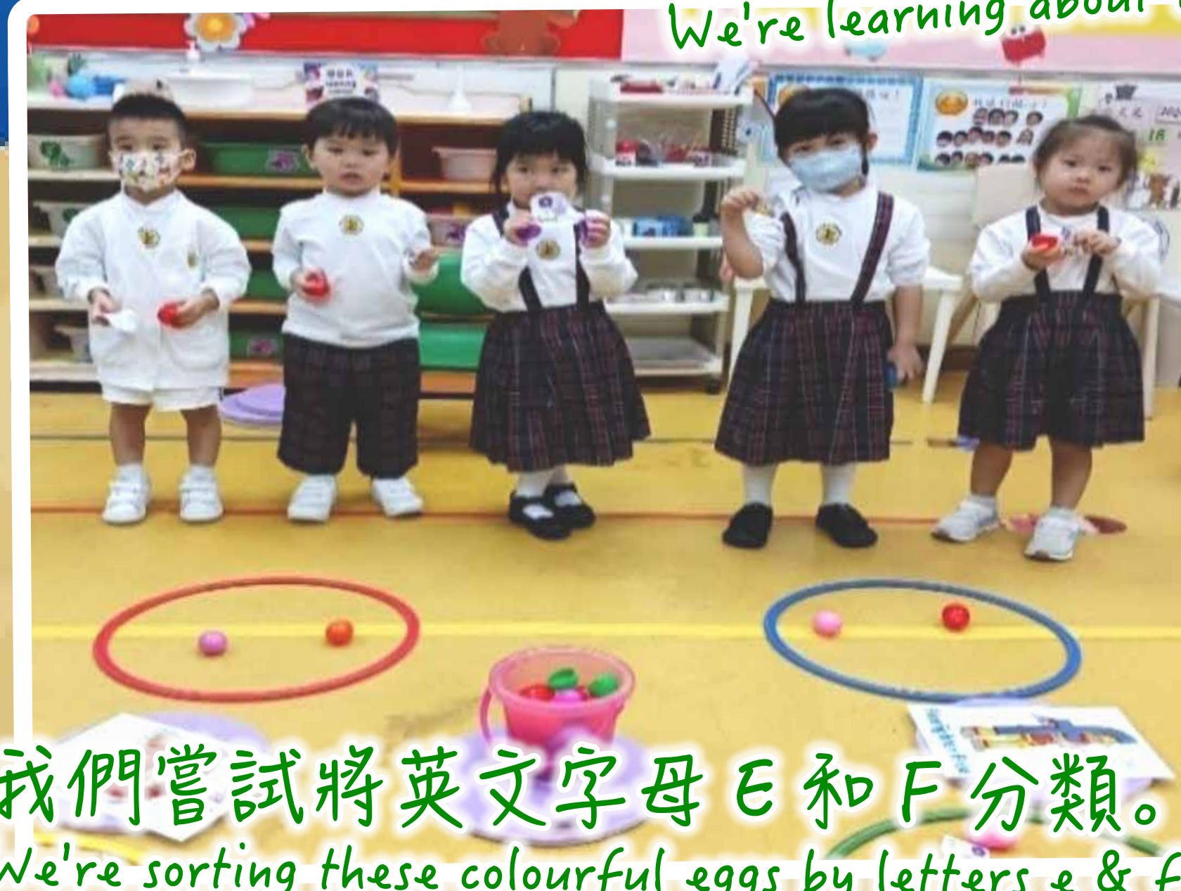
我們嘗試將英文字母 E 和 F 分類。 We're sorting these colourful eggs by letters e & f!