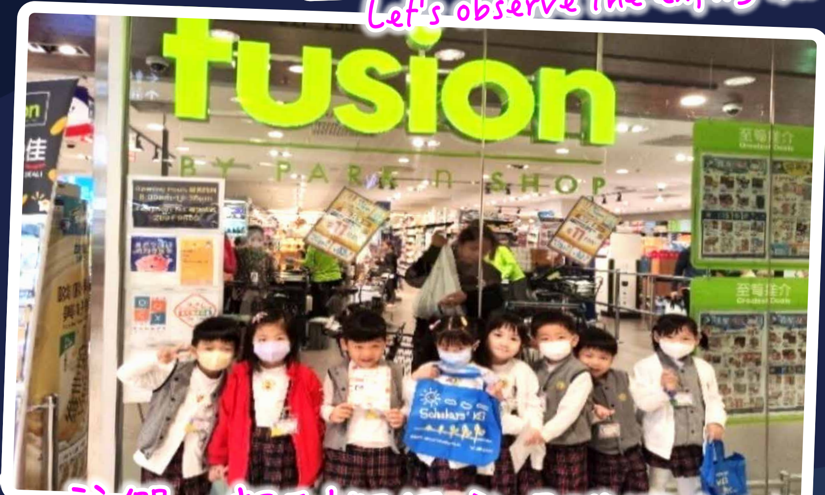
我們一起到超級市場購買食材！ Let's go to the supermarket to buy some ingredients together!