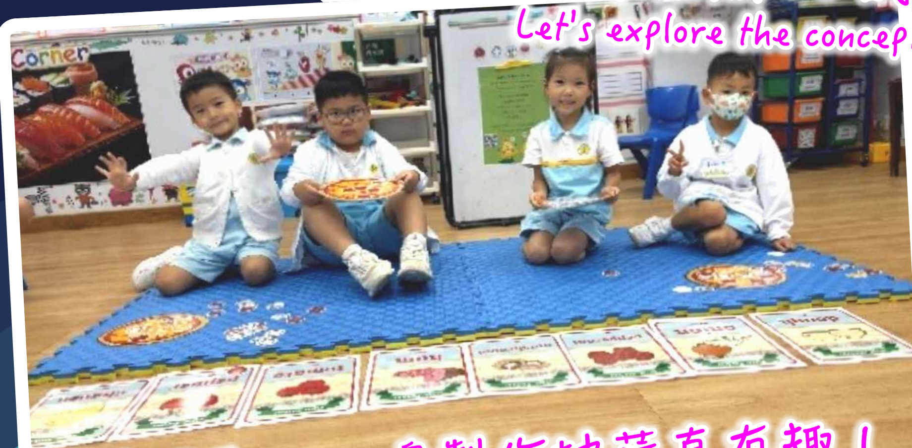
一邊唱歌，一邊製作披薩真有趣！ Singing, playing and pizza making, what more could we ask for!