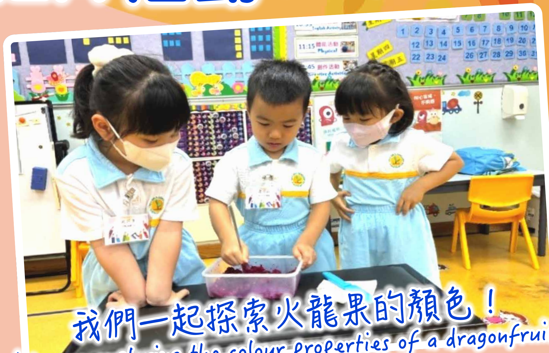
我們一起探索火龍果的顏色！ We are exploring the colour properties of a dragonfruit!